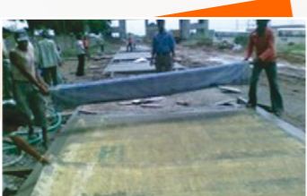
Vaccum Dewatering System