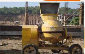
Concrete Mixer Machine