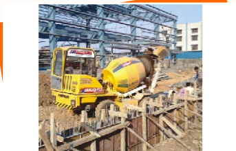
Ajax Fiori Self Loading Mobile Mixer Machine