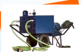
Vaccum Dewatering System