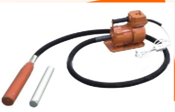
Electric Concrete Vibrator