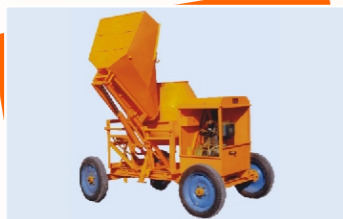
Concrete Mixer Machine