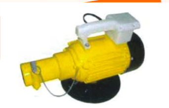
Electric Concrete Vibrator