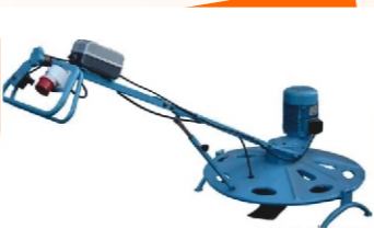
Trimix Machine (Floater)